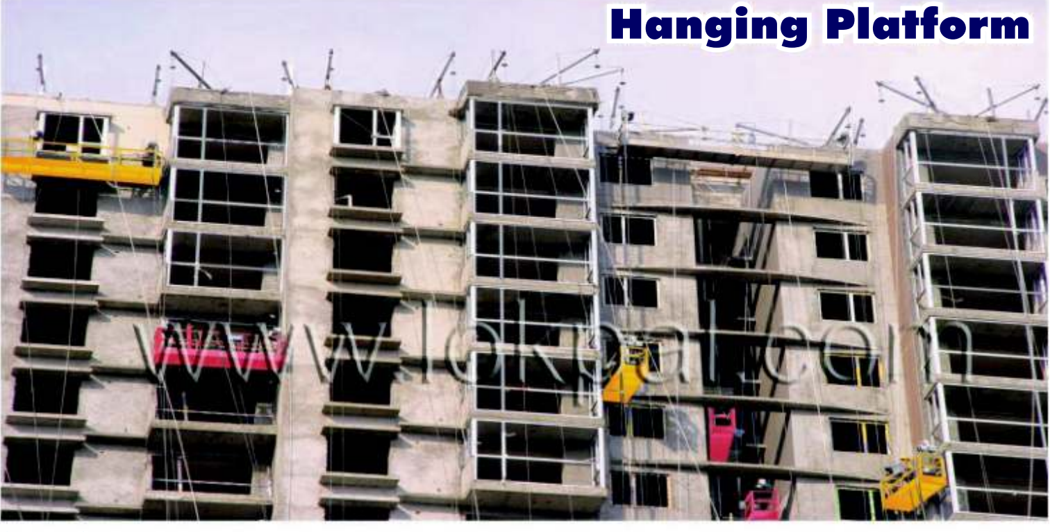
Cradle Systems being used for Finishing, Plastering, Painting, Glass Fixing and Aluminum Fixing